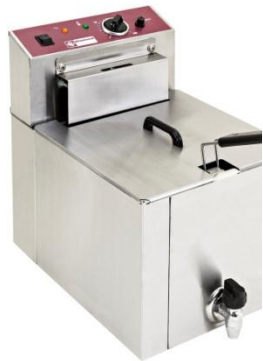
Part List Fryer Mod: F12TR/SP