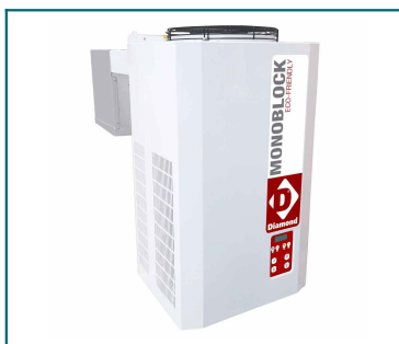
INDICATIVE PRODUCT IMAGE