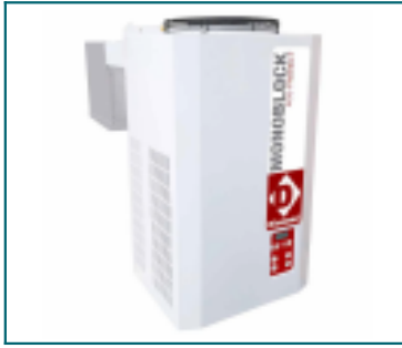
INDICATIVE PRODUCT IMAGE