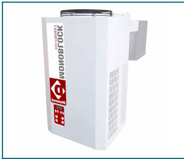
INDICATIVE PRODUCT IMAGE