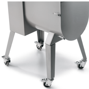
Optional legs with wheels