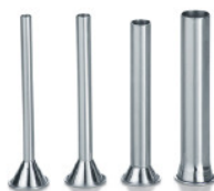
Optional s/s funnels ø 13-16-20-38