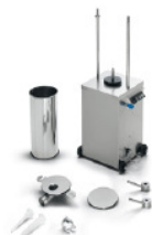
Very easy to clean