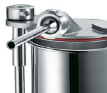
Optional s/s bush